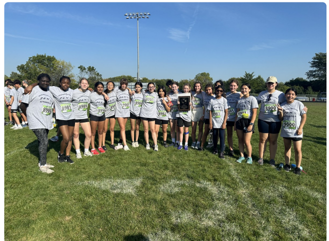
7TH GRADE TEAM