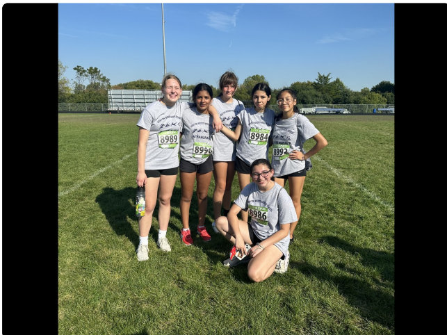
8TH GRADE TEAM